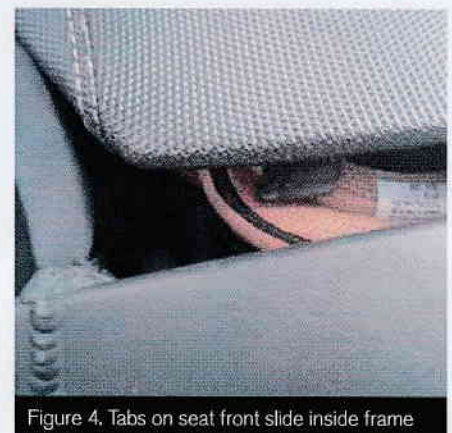
Figure 4. Tabs on seat front slide inside frame

On MY15 or later motorcycles, reinstall the seat using the original seat bolts and a T45 Torx wrench. Again, be sure the seat tabs slide properly inside the frame and below the tank. Torque the seat bolts to 16 ft-lbs.