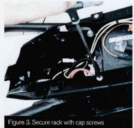
Figure 3. Secure rack with cap screws

Reinstall seat on a MY13 or MY14 motorcycles using the original seat bolts or replacement M8x50 seat bolts and the 5 mm allen key. Before securing the seat bolts ensure that the tabs on the seat's front properly slide inside frame below tank. Torque the seat bolts to 16 ft-lbs.